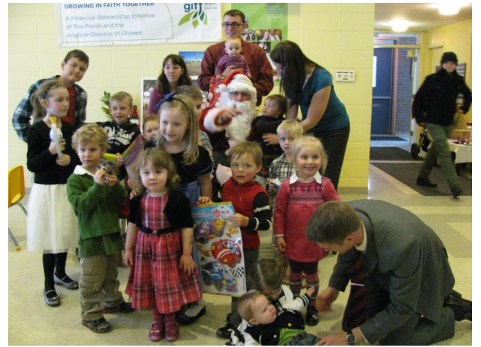
After Santa's visit.