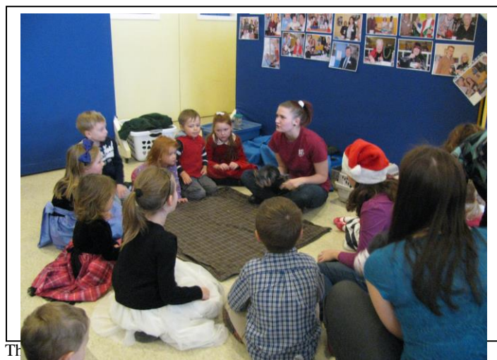
The Christmas Party.