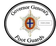
Regimental Coin Approx. 1.5 inches in diameter